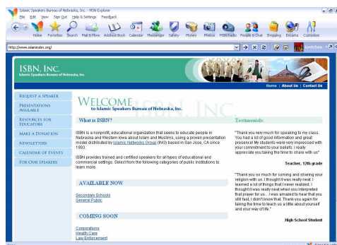
Redesigned homepage: www.islamicsbn.org

Find out more about us, request a speaker, or purchase tickets to upcoming events. It's all there!